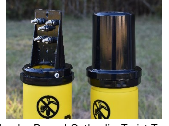
Mamba Round Cathodic, Twist Top