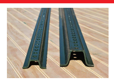
U-Channel Support Post