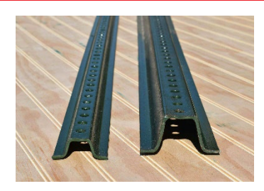
U-Channel Support Post