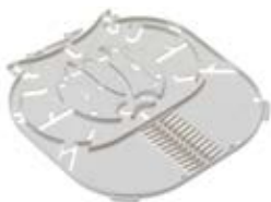
FMTS Splice Tray 12HS (1pc) R895101