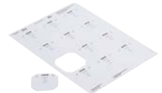
Labeling Sheet R830928