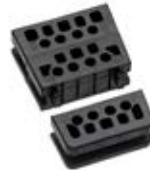
IP54 - 12x2-2.7mm R820287