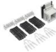
IP65 - 12x2-3mm R820286