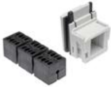
IP65 - 3mm-9mm R820283