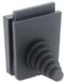
IP54 - 3-13mm R820285