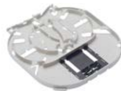
FMTS Splitter Tray (6pc) R820097