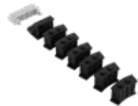
12x 4-5mm R872832