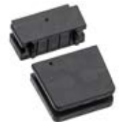
Blind Element R851089