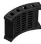
15x 2-3mm R851098