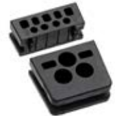
IP54 - 4x2-2.7mm & 3x7mm R820289