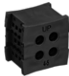
4x 4-5mm R820291