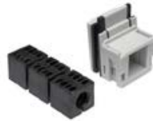
IP65 - 9mm-13mm R820284