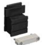
Cover Kit R851088