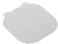
FMTS Tray Cover (1pc) R895103