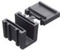
IP55 - Bridge 2x box R820290