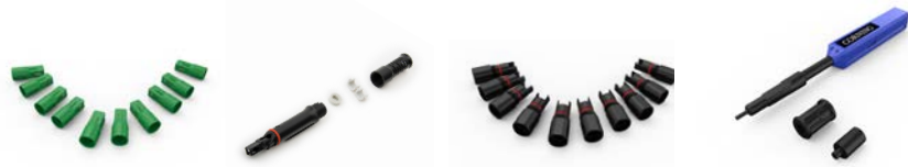
Evolv SC Converter with Pushlok Technology

Field-installable SCA and OptiTap® converters provide simple compatibility with existing infrastructure. Port cleaners offer full cleaning of the connector end face for both Pushlok and OptiTap connectors. Terminal covers can be painted to make terminals virtually disappear on building façades. Bracketry options support easy, go-anywhere installation.