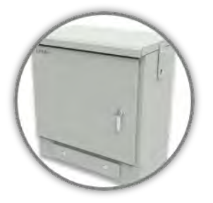
Step 1: Choose a Cabinet Select a cabinet based on environment (NEMA rating), installation type (pad, pole, or wall mount) and required rack spaces.