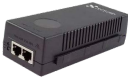
TL-PI-60W Injects 60W PoE onto cable runs.