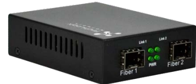
TL-MC-1S1S 1G media converter with dual fiber ports. Ideal for converting multimode to single mode or duplex to simplex when using compatible SFP modules.