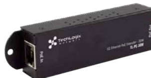
TL-PE-30W Extends 30W PoE beyond the 100m maximum distance. Up to 5 units may be cascaded.