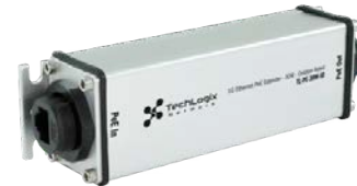
TL-PI-30W-IO Extends 30W PoE beyond the 100m maximum distance. Up to 5 units may be cascaded. Supports outdoor installation and harsh environments.