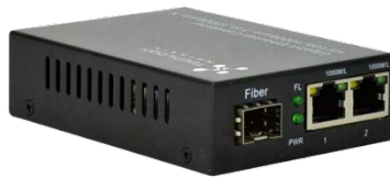
TL-MC-1S2R 1G media converter with a single fiber port and dual twisted pair ports. Ideal for supporting two twisted pair devices simultaneously.