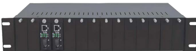
TL-RKMC-14 front panel (media converters sold separately)