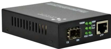
TL-MC-1S1R Basic 1G media converter for adapting fiber to twisted pair. Also available in 10G (TL-MC10G-1S1R) and with PoE+ injection (TL-MC-1S1RPP).