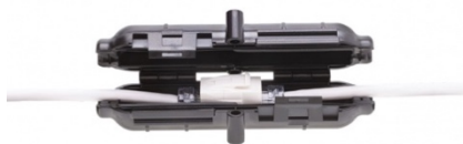
744 coupler & splice housing