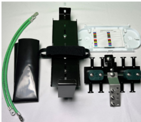
Front Side View of Brackets